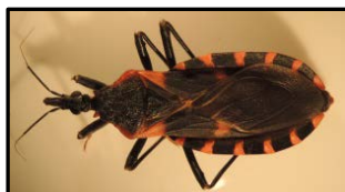
Triatoma sanguisuga , A kissing bug vector of Chagas disease

The vector-borne protozoan parasite Trypanosoma cruzi causes Chagas disease in humans and dogs. The nocturnal insect vector, commonly known as the kissing bug, can transmit the parasite to hosts by biting and subsequently defecating near the site of the bite. The parasites contained in the feces of the bug infect the dog via mucous membranes or breaks in the skin. Dogs can also acquire infection by eating infected bugs. Congenital transmission is also possible.